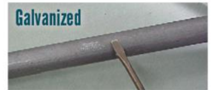
You have a galvanized pipe if...