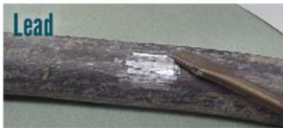
You have a lead pipe if...