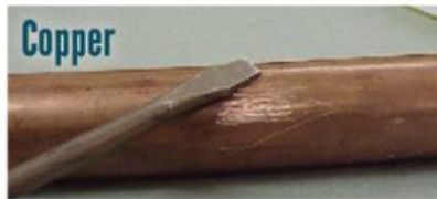
You have a copper pipe if...