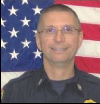
CHIEF RON BROWNING MARCH 21, 1973 - JULY 29, 2016