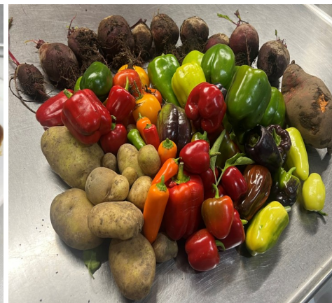
Fresh local veggies are used