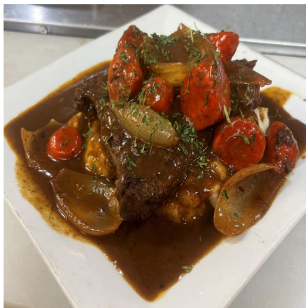
Delicious Pot Roast