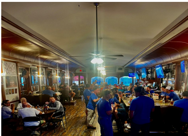
A typical crowded night in Shelly's

Hours are Tuesday-Thursday 11 am-10 pm; Friday & Saturday 11 am-11 pm; Sunday brunch 9 am-1 pm.