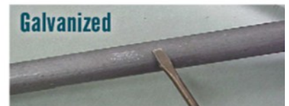
You have a galvanized pipe if...

The Scratch Test ...the scraped area is copper in color, like a penny.