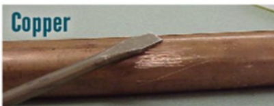
You have a copper pipe if...

The Scratch Test ...the scraped area is shiny and silver.