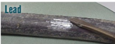
You have a lead pipe if...

Locate your water service line where it enters your home/building—usually in a utility room or crawl space—and connects to the water meter. Identify a test area on the pipe between the entry point and the inlet valve/meter. If covered, expose a small section of metal.