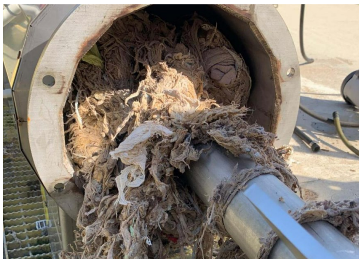
Pictured above: A clogged sewer pump showing clumps of wipes and other debris that were flushed in toilets

Wipes marketed as “flushable” maintain their strength and can still be intact several months after they have been flushed. These wipes continue to attach to each other and will then cause a larger blockage.